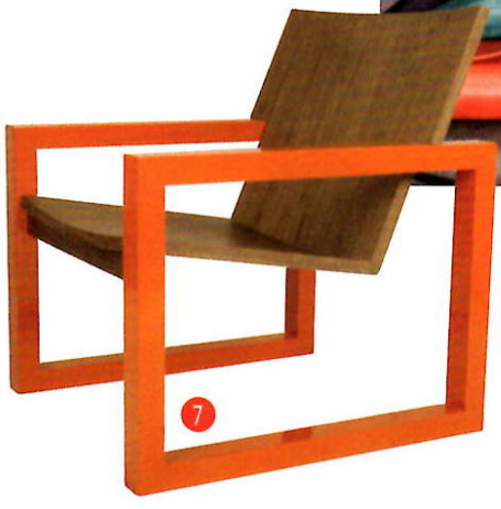
1 CATIFA Chairs and PARENTESIT Wall Panels, arper.com 2 Flamingo Bathtub, drummonds-uk.com 3 Long Bench by Coralla Maiuri, artemest.com 4 Fusion Side Table, tidelli.com 5 NusaDua Garden Seat, tidelli.com 6 Ranger Leather, aniline dyed, edelmanleather.com 7 Stella Lounge Chair, davidbriansanders.com 8 MBH Architects Office, mbharch.com